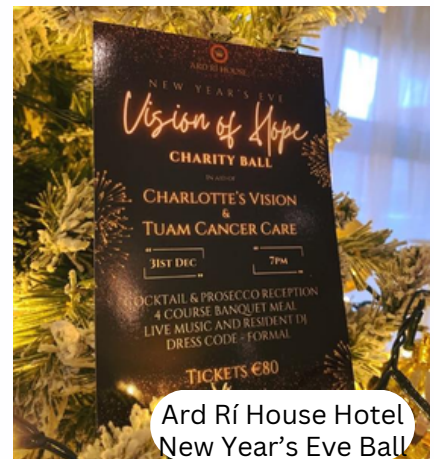
Ard Ri House Hotel New Year's Eve Ball