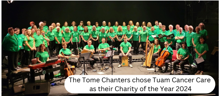
The Tome Chanters chose Tuam Cancer Care as their Charity of the Year 2024