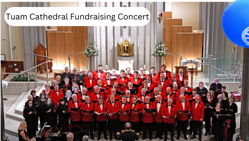
Tuam Cathedral Fundraising Concert