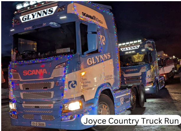
Joyce Country Truck Run