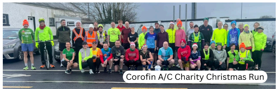
Corofin A/C Charity Christmas Run